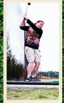
Above: The First Tee of Brunswick County teaches kids ages 7 to 17 the skills and values they'll need to succeed on the golf course and in life.