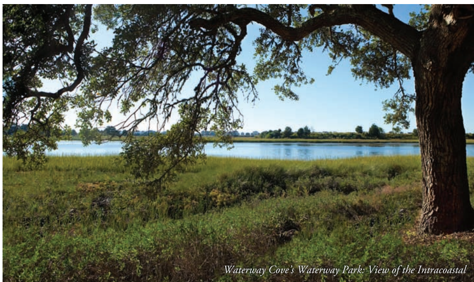
Waterway Cove’s Waterway Park: View of the Intracoastal

The tournament format will be a four-person team event, Captain’s Choice. The entry fee is $380 per team