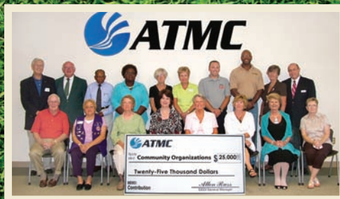
Left: The First Tee of Brunswick County was the recipient of a 2010 ATMC community grant, which provided printers for the new computer lab.